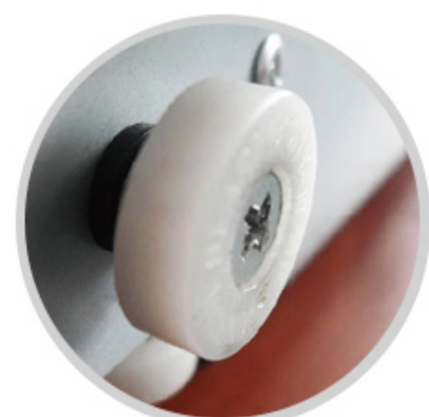
Durable Nylon Roller